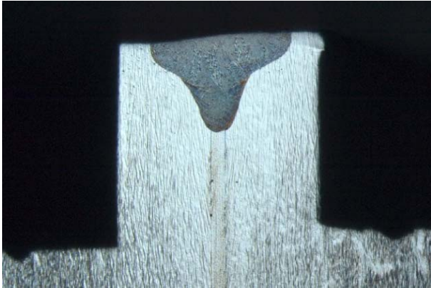
Figure 1: Micrograph showing the EB weld geometry

The foil was electron beam (EB) welded to the support flange with a cover plate to prevent local buckling. A wide, shallow weld was adopted to ensure leak-tightness (Fig. 1). The completed assembly (Fig. 2) was helium leak tight to below 5 \times 10^{-11} \text{ Pa.m}^3.\text{s}^{-1} . Deformation of the plate was measured to be 3.05 mm with a \Delta P of 0.1 MPa, compared with the calculated value of 2.07 mm.